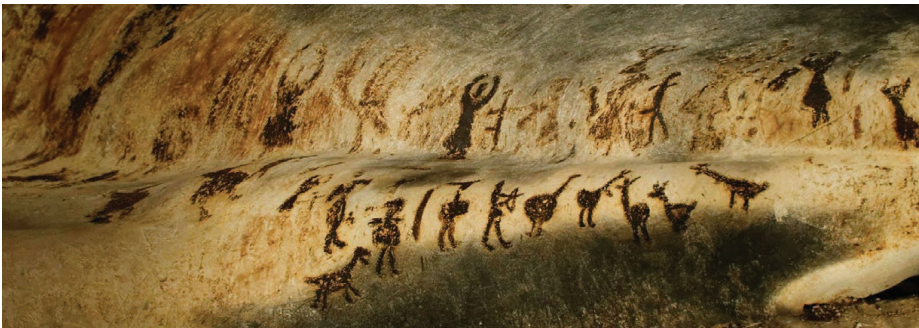
Ancient stone drawings "Magurata" cave West Fore-Balkan

• Initiatives promoted among the Western Balkan countries relating to Broadband for All, high-speed cross-border connectivity and gradual reduction/abolition of roaming charges for these countries. Thus Bulgaria will contribute to WSIS Action Line 2 and hence – the implementation of the Sustainable Development Goals.