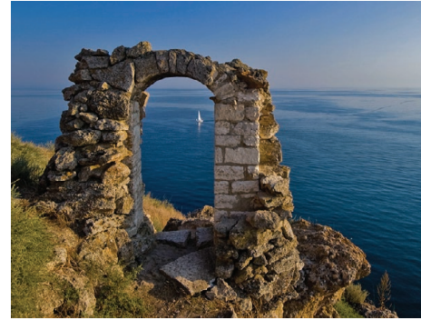
Cape Kaliakra, Black sea

• Successful implementation of two pilot projects within the framework of the ITU regional cooperation: (1) Provision of IT skills and specialized hardware equipment and software for elderly people and for people with visual impairments, and (2) Provision of free internet access for the residents of a border region in Bulgaria.