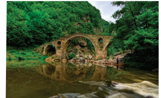
Dyavolski most "Devil's bridge", Arda River Rhodope Mountains

• Active participation in debates on key issues within the remit of the ITU.