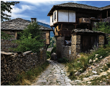
Historical village of Kovachevica, West Rhodope